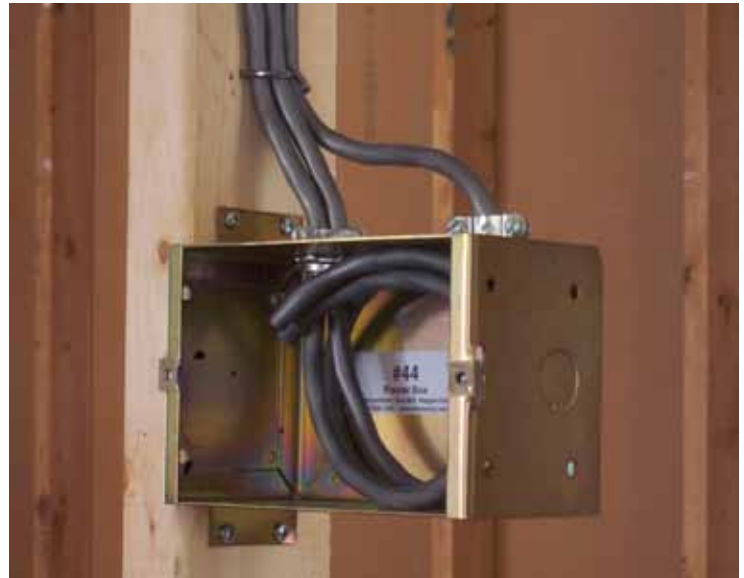
#44 Plaster Box

A plaster box is used to mount a wall panel into the wall in new construction where the box can be attached to the stud before drywall is installed. The plaster box provides a secure mount for the panel, a secure grip on the cable, and protection for the connections to the terminal screws on the panel.