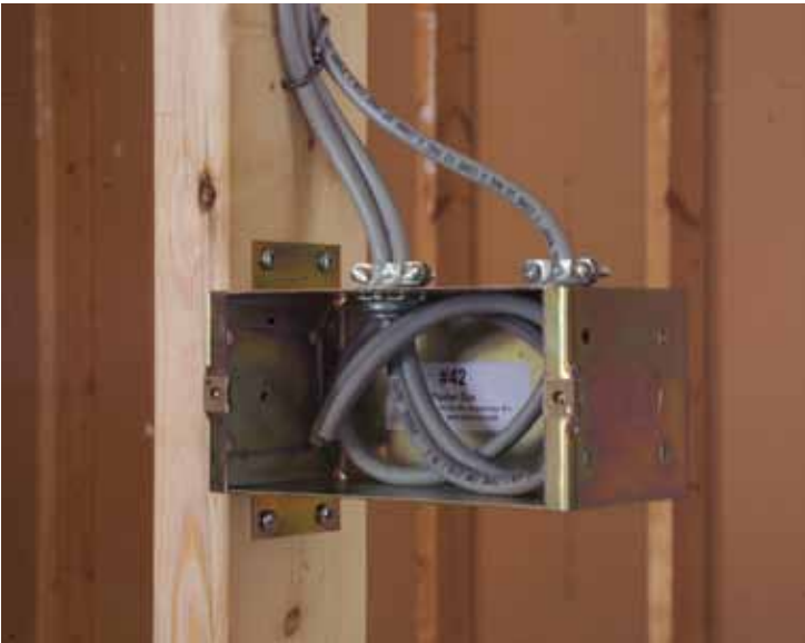
#42 Plaster Box